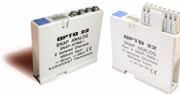
SNAP Isolated Analog Input Modules

Transformer isolation prevents ground loop currents from flowing between field devices and causing noise that produces erroneous readings. Ground loop currents are caused when two grounded field devices share a connection, and the ground potential at each device is different. Optical isolation provides 4,000 volts of transient